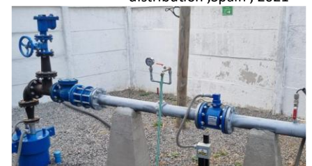
MAGX2 ,Construction ,Chilie , 2023