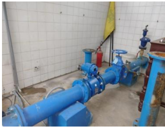
MAGX2, Water Supply Peru, 2023