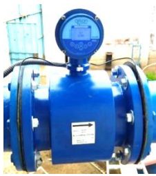
MAGX2, Sanitation ,Peru, 2023