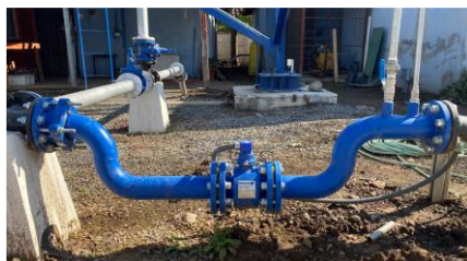
MAGX2 , Water distribution ,Chilie , 2023