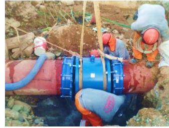
MAGX2, Sanitation , Peru, 2022