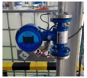
MAGX2 , Water distribution ,Spain , 2021