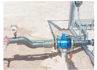
MAGX2 , Mining ,Chilie , 2023