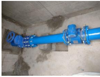
MAGX2, Grey water systems Peru,2022