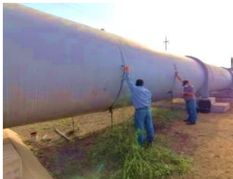
USCX100 ,DN1000 Water Supply , Peru ,2022