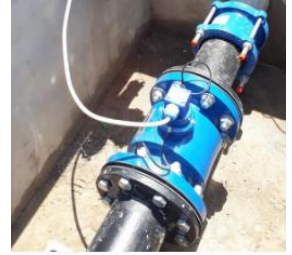
MAGX2, Sanitation , Peru 2022