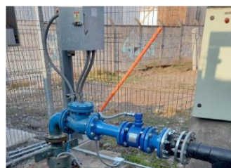
MAGX2 , Oil & Gas ,Chilie , 2023